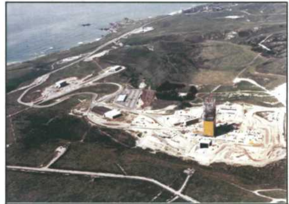
Construction of SLC-6 at Vandenberg AFB, CA - 1966

Summary. The MOL Program was moving toward its objectives over the timeframe from 1965 to 1969. However, cost and budget issues arose, and on 10 June 1969 the Department of Defense announced cancellation of the Manned Orbiting Laboratory Program.