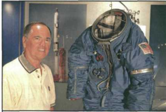
Bob Crippen with MOL Space Suit