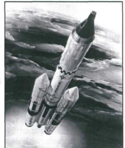
MOL Launch - Artist's Concept

lose some active members to burnout. The feelings of "been there, done that" and that